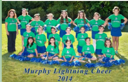
Murphy Lightning Cheer 2014