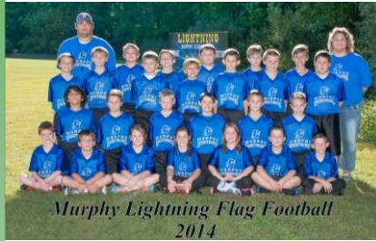
Murphy Lightning Flag Football 2014